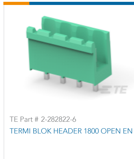
TE Part # 2-282822-6 TERMINI BLOK HEADER 1800 OPEN EN