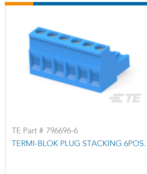
TE Part # 796696-6 TERMINI-BLOK PLUG STACKING 6POS.