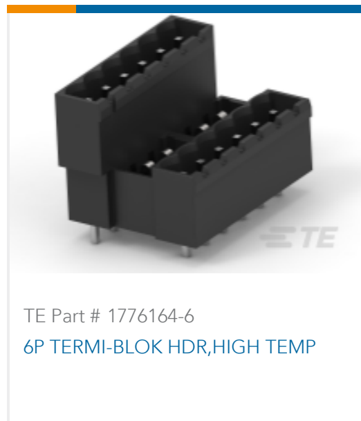
TE Part # 1776164-6 6P TERMIN-BLOK HDR,HIGH TEMP