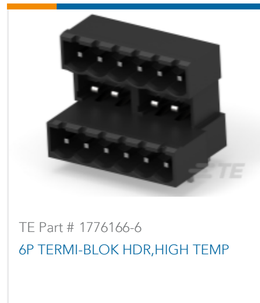
TE Part # 1776166-6 6P TERMIN-BLOK HDR,HIGH TEMP